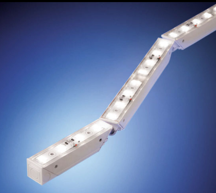
Euclid 20 Balljoint IP20 System adjusts on-site to follow complex profiles

Tel 44 ( 0 ) 208 348 9003 Web www.radiantlights.co.uk Email david@radiantlights.co.uk