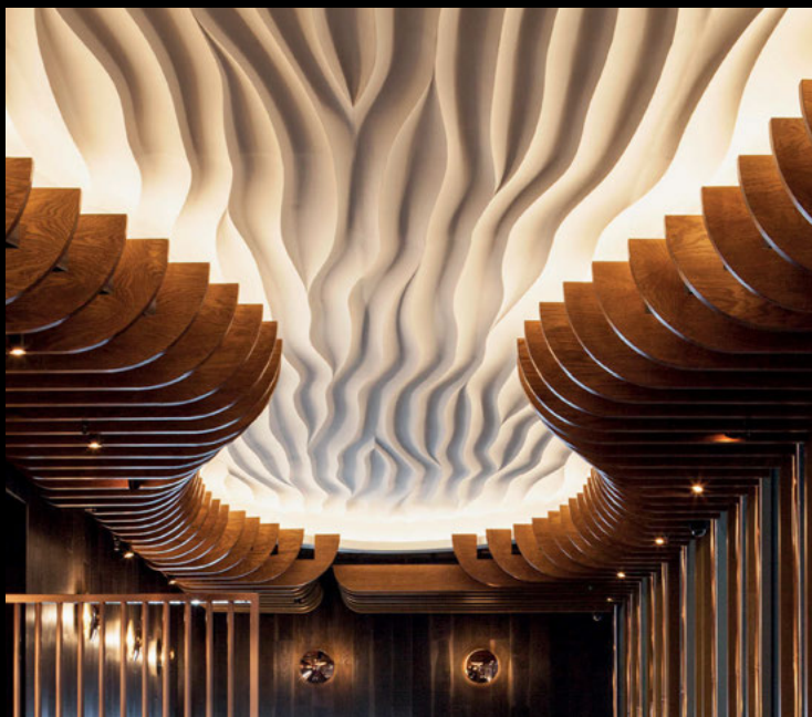
Haz Restaurant, London Lighting design by Nulty